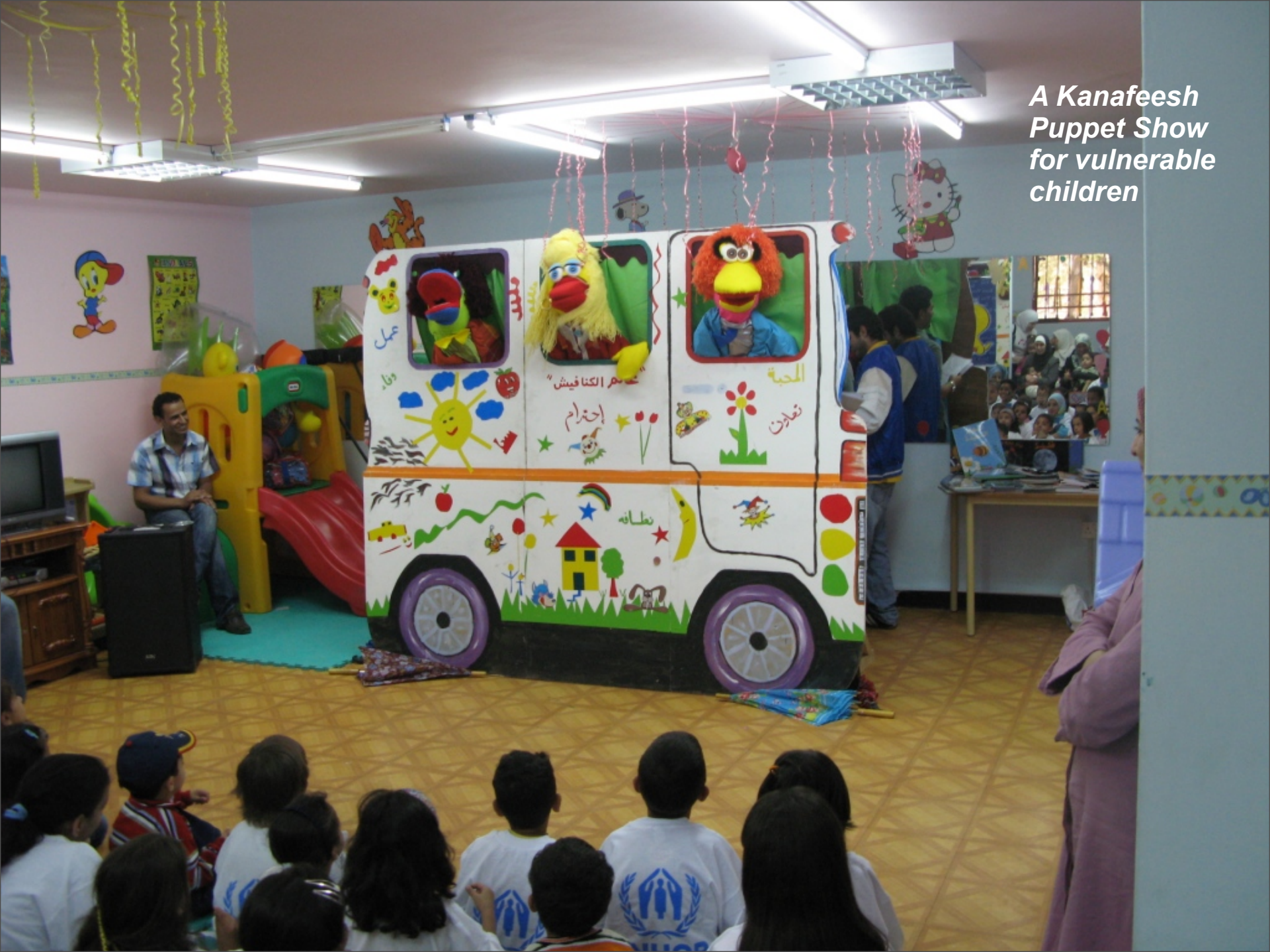
A Kanafeesh Puppet Show for vulnerable children