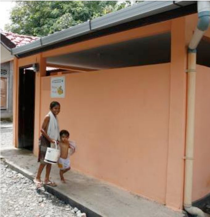
Using a new bath house in Aceh, Indonesia