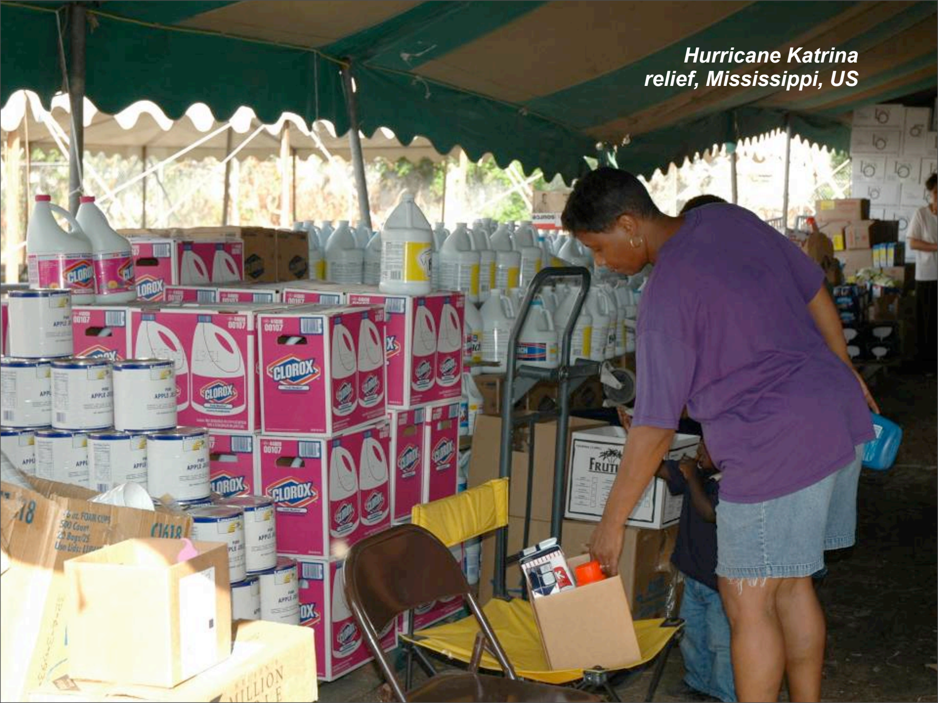
Hurricane Katrina relief, Mississippi, US