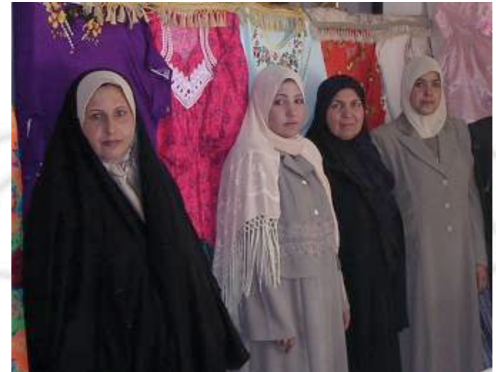
Women in sewing shop funded by IRD micro-grant, Iraq