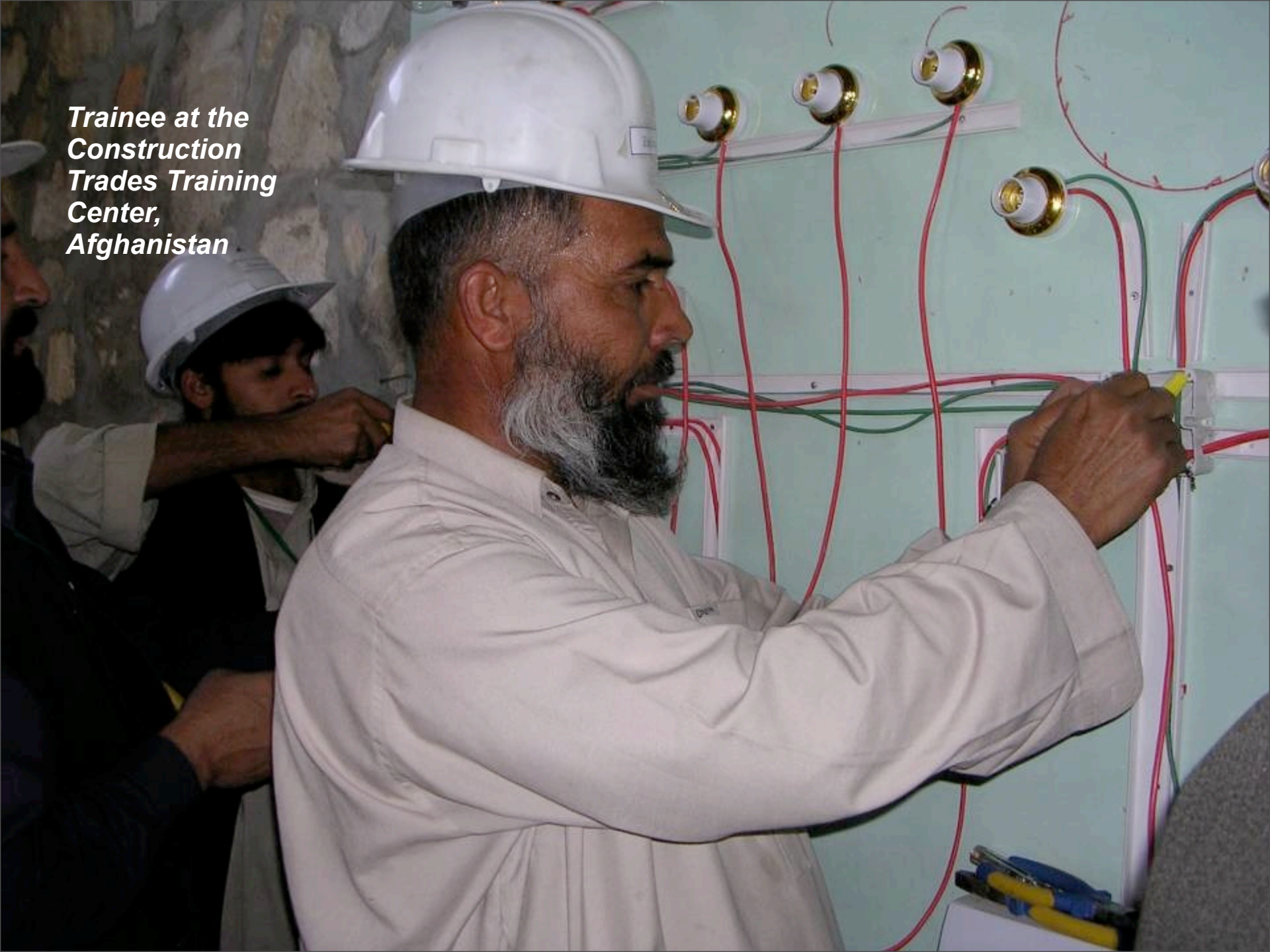
Trainee at the Construction Trades Training Center, Afghanistan