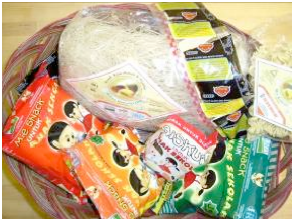
Nutritious, low cost food products, Indonesia