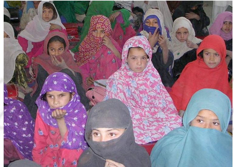
Girls at primary school with construction overseen by IRD, Afghanistan