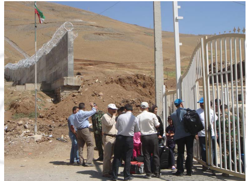
Repatriation of Iraqi Refugees from Iran under the UNHCR Humanitarian Assistance in Iraq