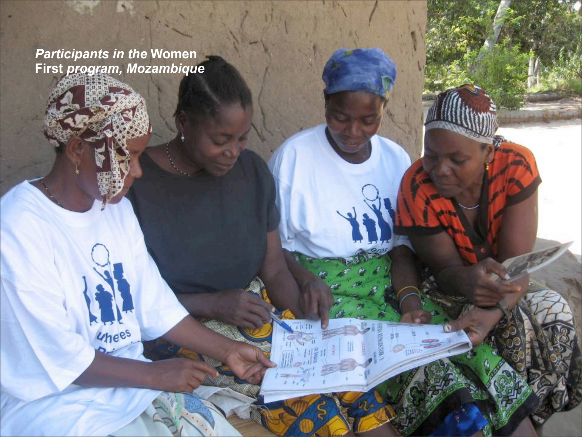
Participants in the Women First program, Mozambique