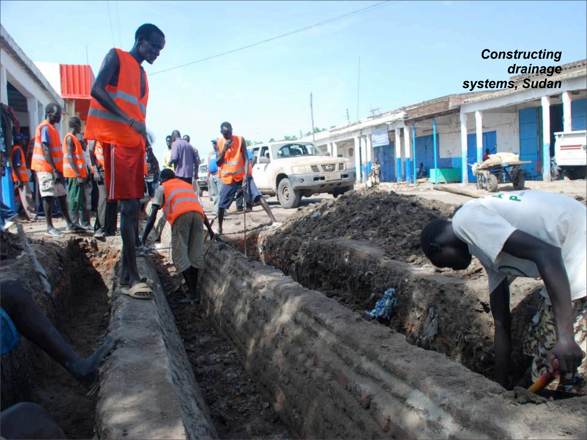
Constructing drainage systems, Sudan