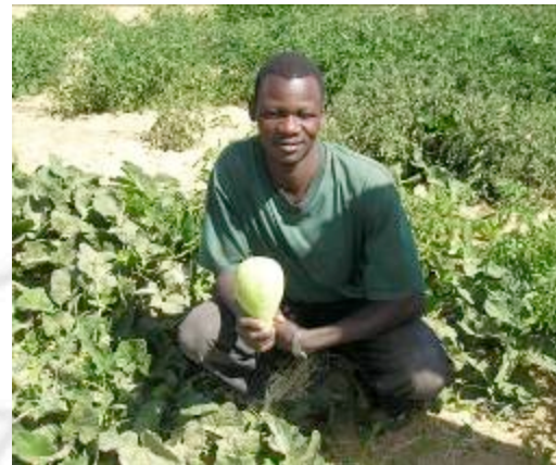
Agricultural assistance assessment, Niger