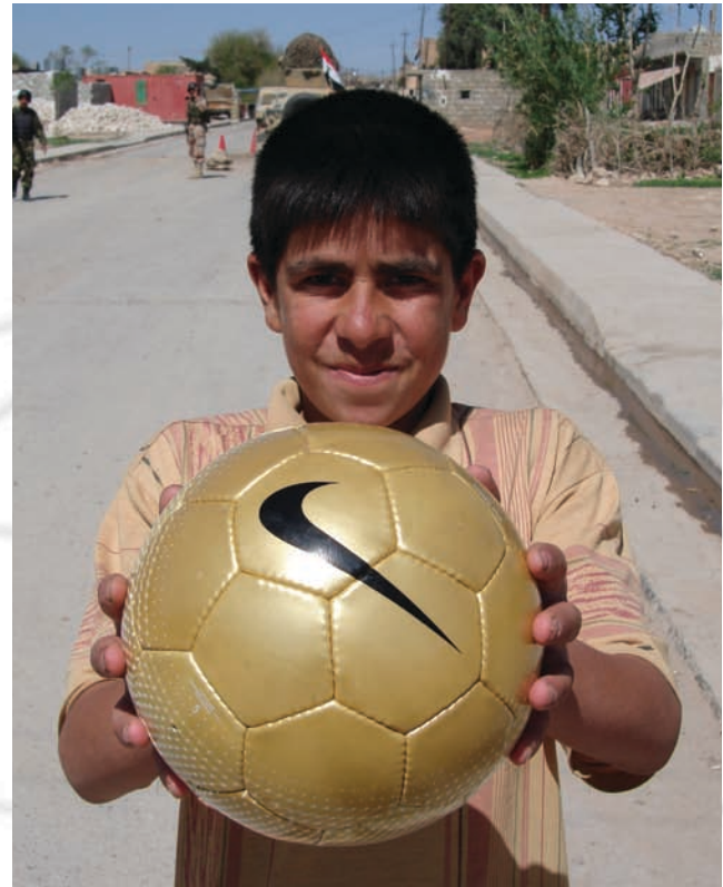
A boy with a donated soccer ball, Iraq