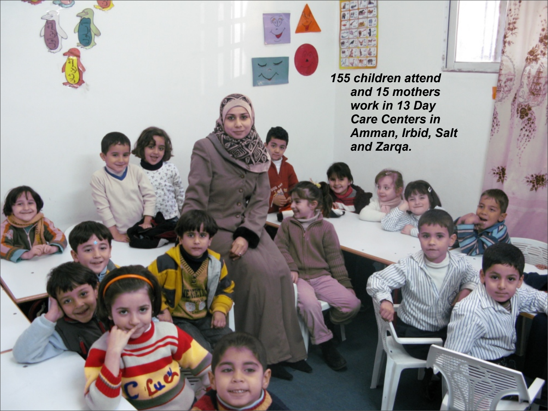
155 children attend and 15 mothers work in 13 Day Care Centers in Amman, Irbid, Salt and Zarqa.