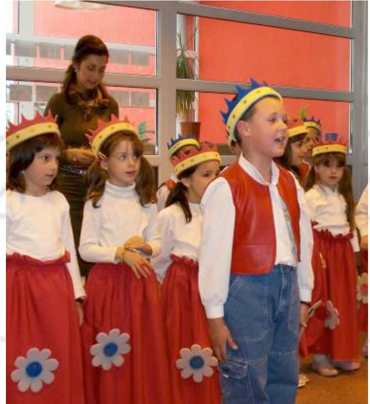
Schoolchildren giving a presentation to IRD, Serbia