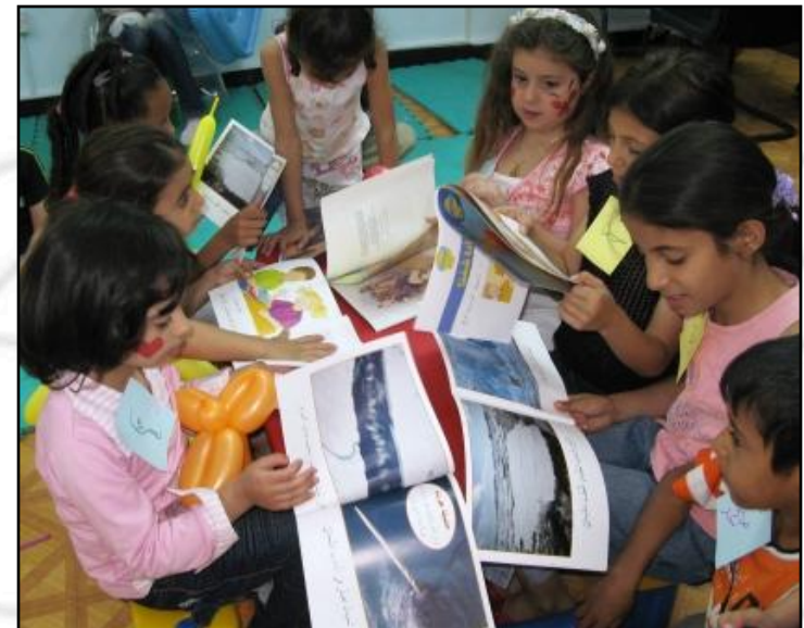
Vulnerable children enjoying scholastic arabic books at local partner clinics