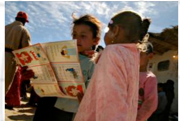
Relief programs in Iraq