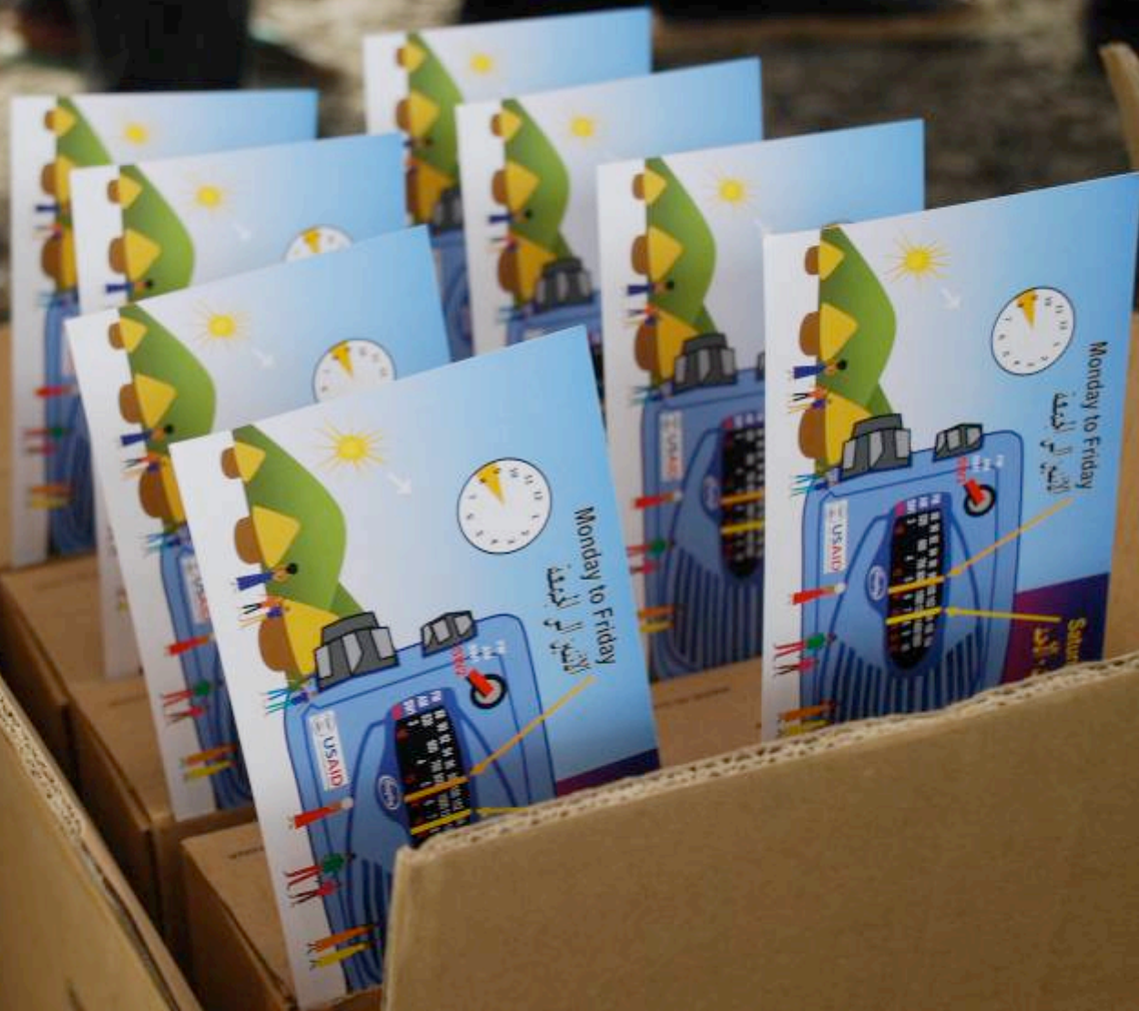
Boxes of radios awaiting distribution, Sudan