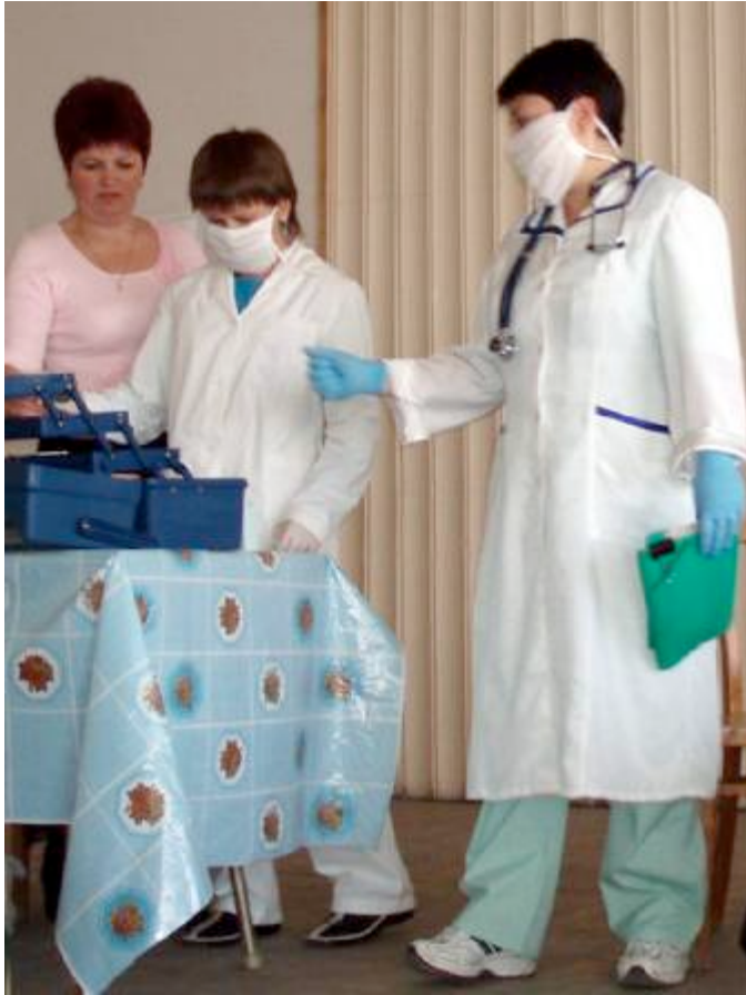
Avian Flu awareness training, Ukraine